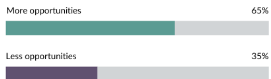
Live polling conducted during the 3rd CCHN Monthly Forum

2. In your opinion, has the COVID-19 pandemic created new opportunities to negotiate or engage with Armed Groups?